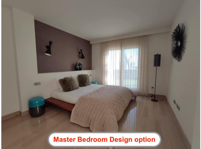
Master Bedroom Design option