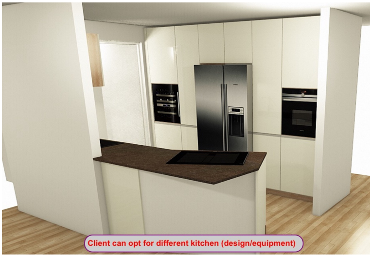
Client can opt for different kitchen (design/equipment)