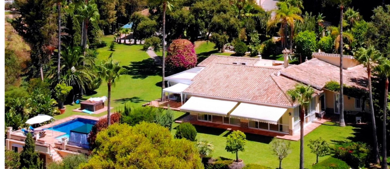
Preciosa plana parcela de 5250 m2 en Marbella, Elviria. Chalet 460 m2, 6 dormitorios, 5 cuartos del baño, casa de servicio 40 m2, garaje 170 m2, pozo, un lago, cerca al campo de golf (200 m).