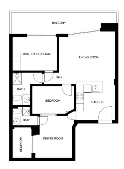
SIZES AND DIMENSIONS ARE APPROXIMATE, ACTUAL MAY VAR