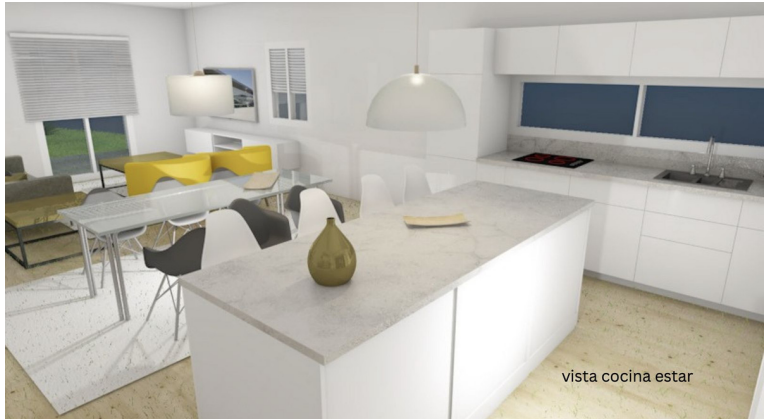
vista cocina estar