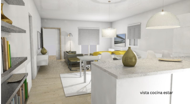
vista cocina estar