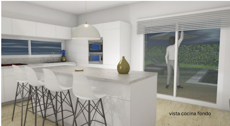
vista cocina fondo