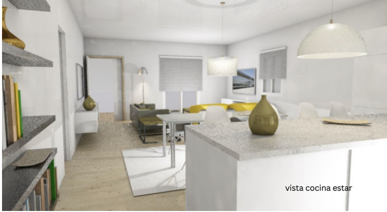
vista cocina estar