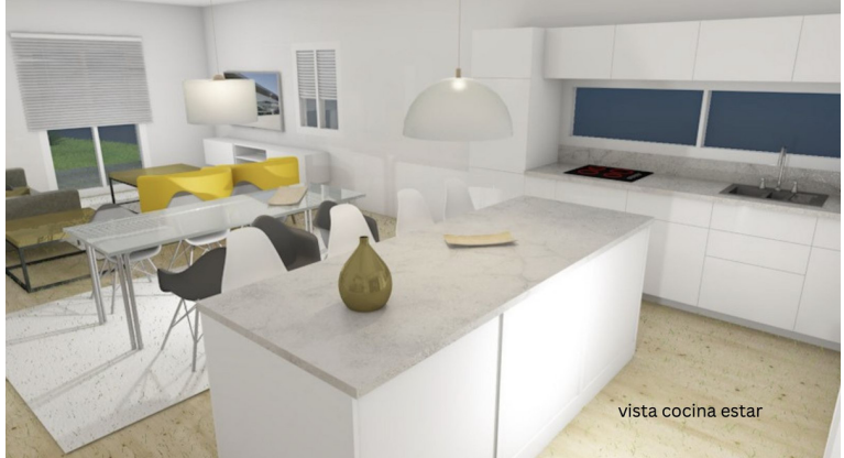
vista cocina estar