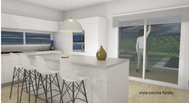
vista cocina fondo