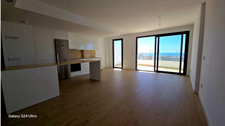
Galaxy S24 Ultra