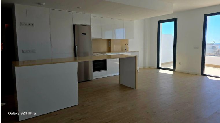
Galaxy S24 Ultra