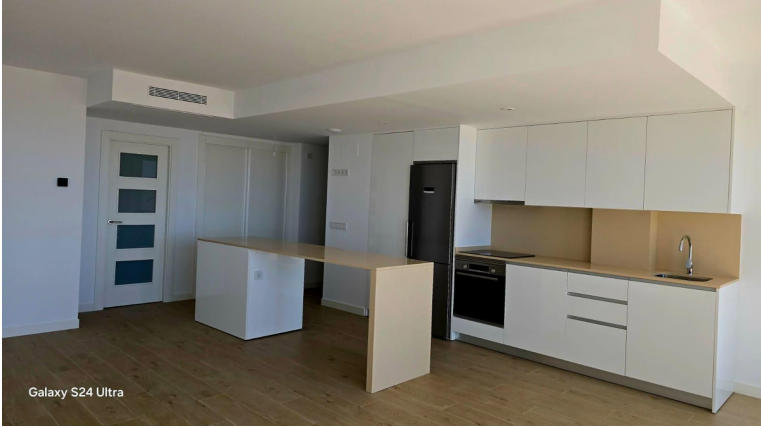
Galaxy S24 Ultra