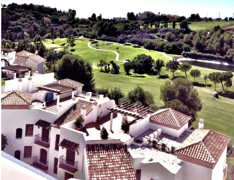
View of 2nd, 3rd & 4th fairway from terrace