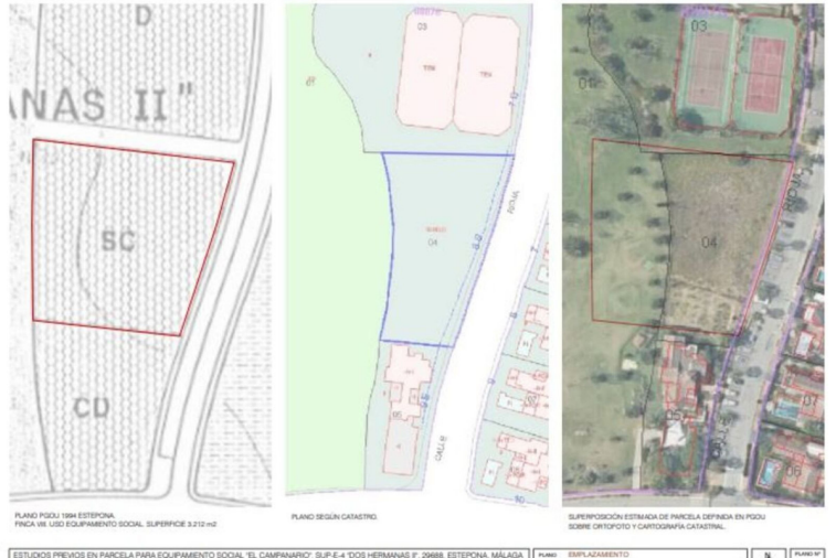
ESTUDIOS PREVIOS EN PARCELA PARA EQUIPAMIENTO SOCIAL "EL CAMPANARIO" SUP-E-4 "DOS HERMANAS" F. 20688. ESTEPOÑA, MÁLAGA PLANO: DESPLAZAMIENTO