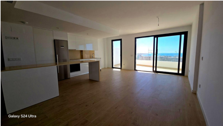
Galaxy S24 Ultra