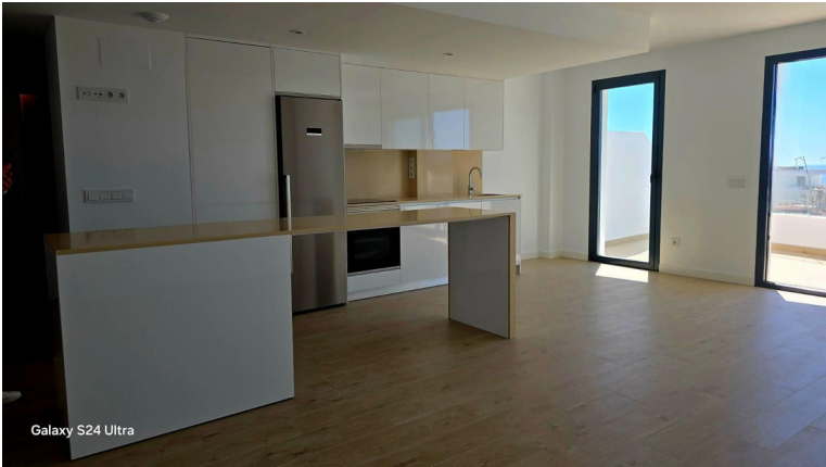
Galaxy S24 Ultra