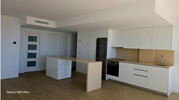
Galaxy S24 Ultra