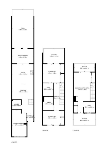
TOTAL: 131 m2 1. PLANTA: 53 m2, 2. PLANTA: 47 m2, 3. PLANTA: 31 m2 ÁREAS EXCLUIDAS: PATIO CUBIERTO: 11 m2, PATIO: 30 m2, BALCÓN: 27 m2