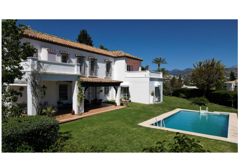
FotoScan de Google Fotos